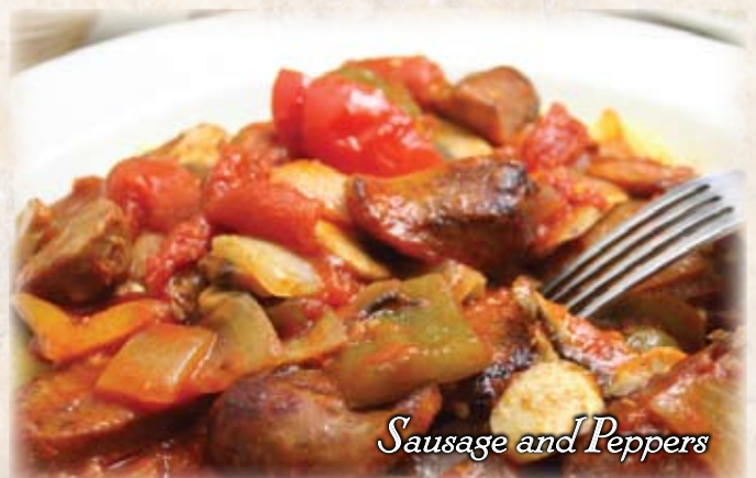
Sausage and Peppers

Grilled Italian sausage with green and roasted bell peppers in marinara sauce.