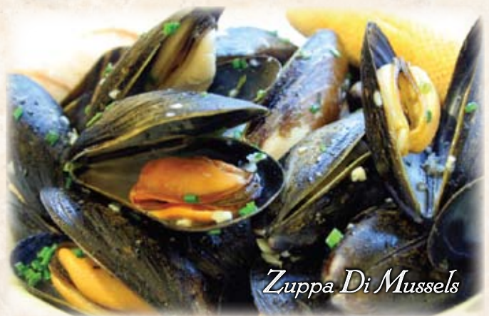
Zuppa Di Mussels