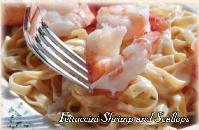
Fettuccini Shrimp and Scallops

(All pastas are served with fresh bread and choice of House or Caesar salad.)